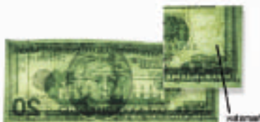
Figure C - Series 1996 and later