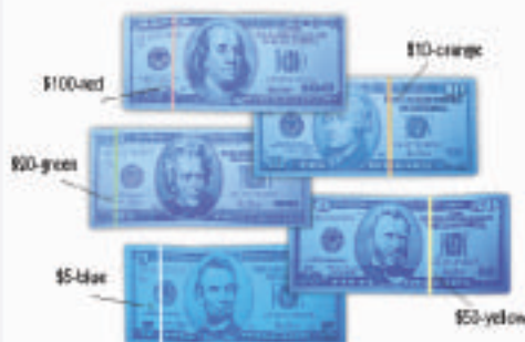
Figure B - Series 1996 and later

Note: Federal Law Requires all Financial Institutions to obtain, verify, and record information that identifies each person who opens an account.