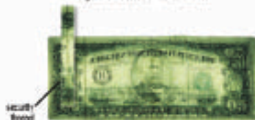
Figure D - Series 1990 through 1995