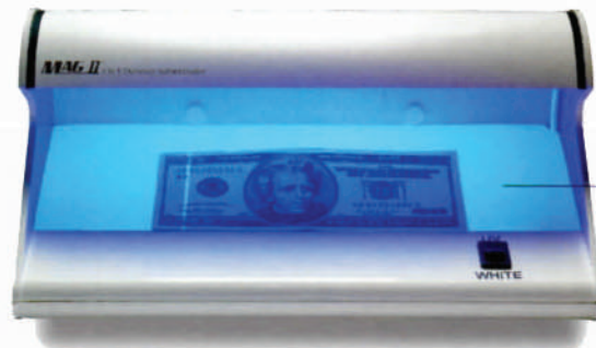
Redesigned $20 note issued in 1998 offers a Security thread that glows green under ultraviolet light.

Nationwide service is available through our authorized dealer network.